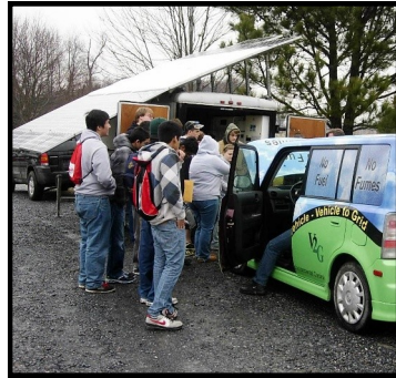
Attendees at the training workshop held in January 2012 learned about solar energy, electric vehicles, wildlife, and aquatic ecology.

Thank you to all the professionals who have provided training during the past year for the students and advisors.