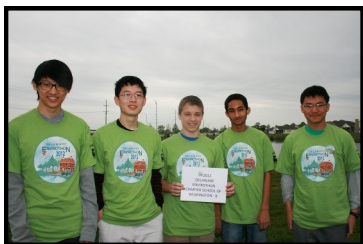
Charter School of Wilmington—Team B