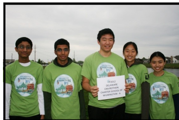
Charter School of Wilmington—Team A