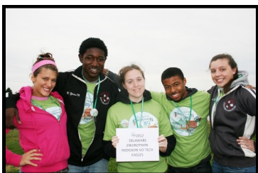
Hodgson Vo-Tech High School—Eagles