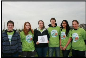
A.I. duPont High School—Bengals