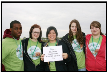
Hodgson Vo-Tech High School—FFA