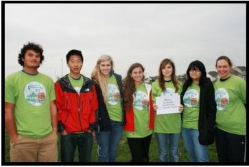
A.I. duPont High School—Tigers