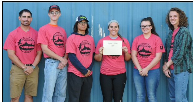
Sussex Tech FFA