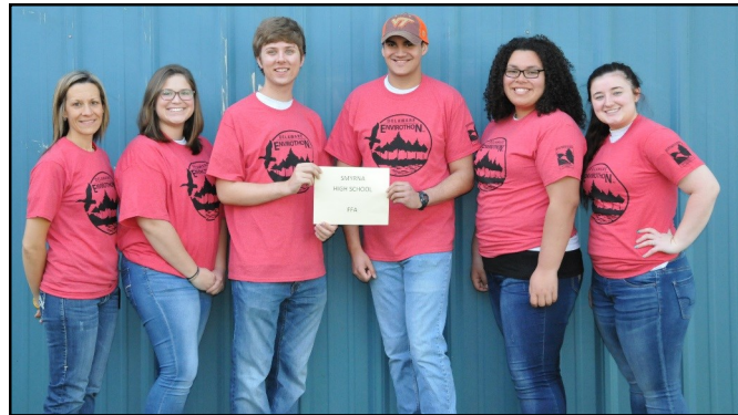
Smyrna High School FFA