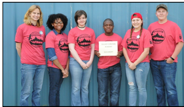
Calvary Christian Team Canopy