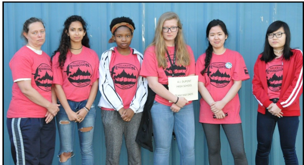
A. I. DuPont High School—Rad Dads