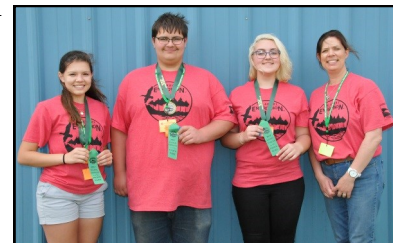
Fourth Place Team Peach Blossom 4-H