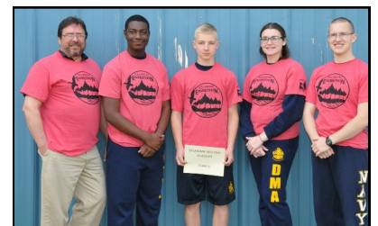
DE Military Academy Team 3