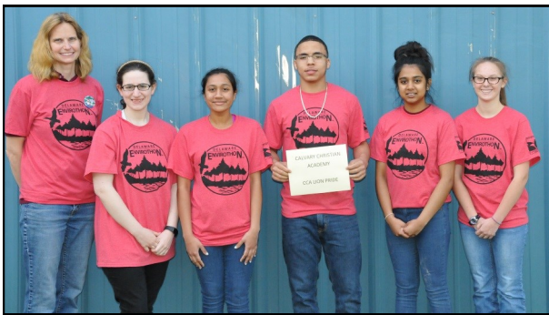
Calvary Christian Team Lion Pride