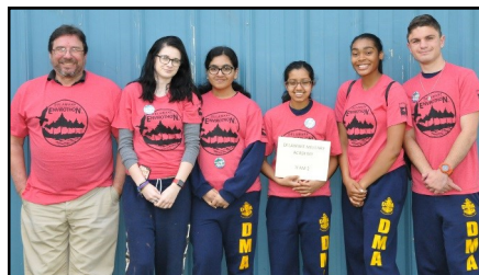
DE Military Academy Team 2