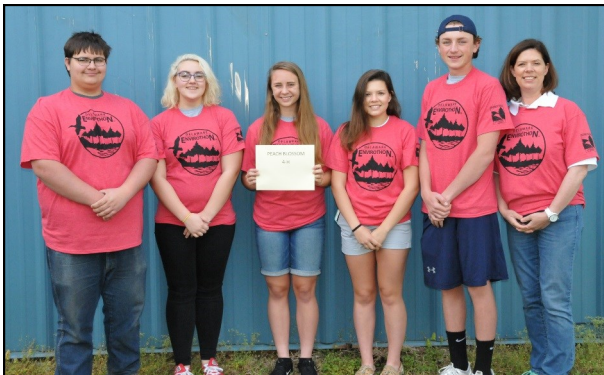
Peach Blossom 4-H