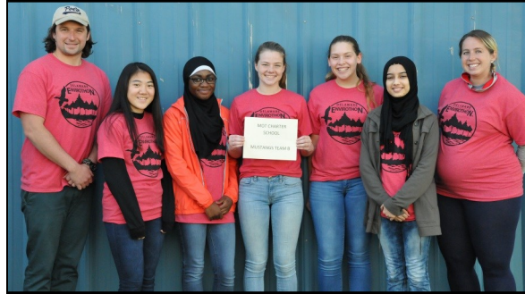
MOT Charter School Mustangs Team B