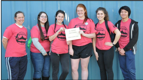
A. I. DuPont High School—Clean Coal