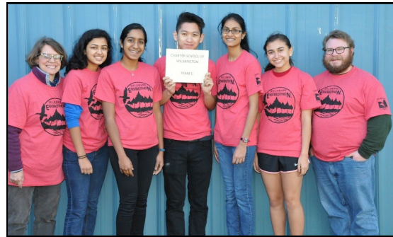
Charter School of Wilmington Team C