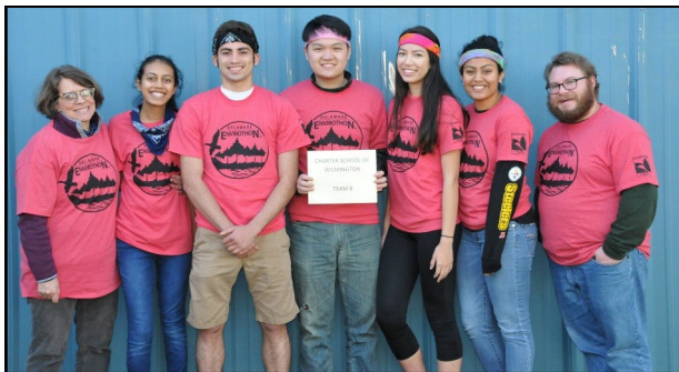
Charter School of Wilmington Team B