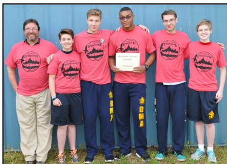
DE Military Academy—The Agals