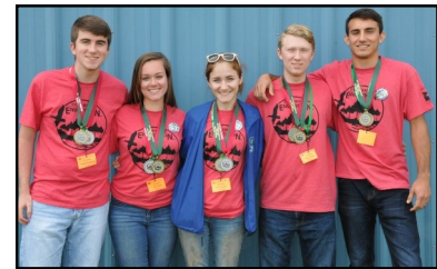
Second Place Team Middletown High School FFA

Four Saturday workshops were held throughout the school year to prepare team advisors and students for the competition.