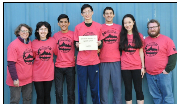
Charter School of Wilmington Team A