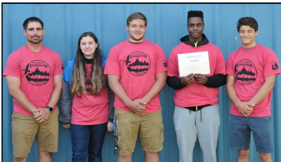
Sussex Tech Team B