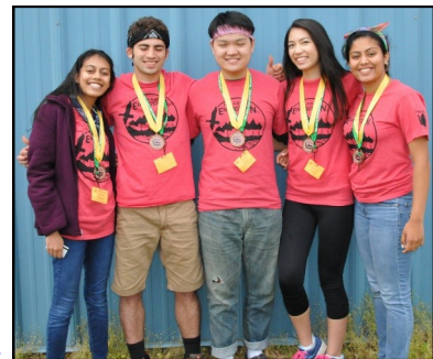
Charter School of Wilmington Team B - Third Place Team