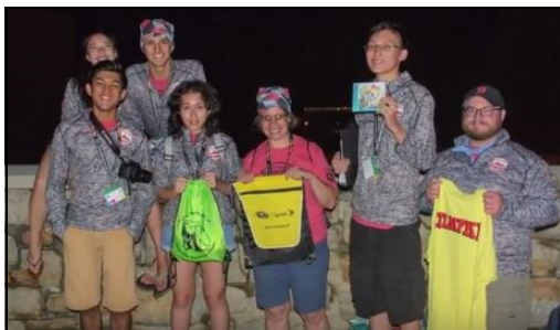
Charter team poses after the "share" session held at Mt. St. Mary's University in Maryland

The team represented Delaware well, placing 12th out of 54 teams and had a 2nd place finish in the public speaking portion of the competition. The scores were close as just a few more points would have moved them up to 6th place. Congratulations!