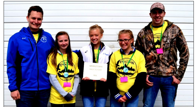
Middletown High School FFA