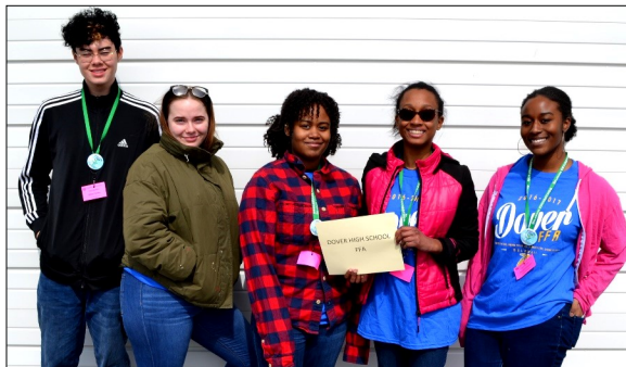
Dover High School FFA