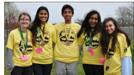
Charter School of Wilmington Team B—3rd Place