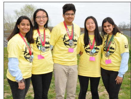
Charter School of Wilmington Team C—2nd Place

The remaining top seven were Peach Blossom 4-H in fourth, Middletown High School in fifth, Delaware Military Academy in sixth, and Newark Charter School in seventh. Other schools competing were: Calvary Christian Academy, Dover High School, Polytech High School, and Sussex Tech High School.