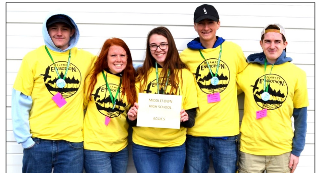
Middletown High School Aggies