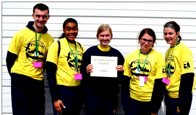
Delaware Military Academy Team 3