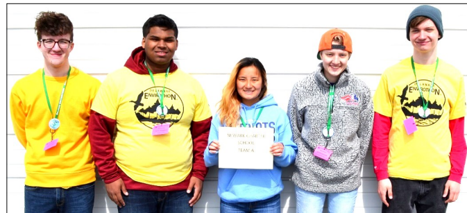
Newark Charter School Team A