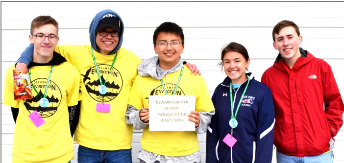
Newark Charter School—Twilight of the Waste Gods