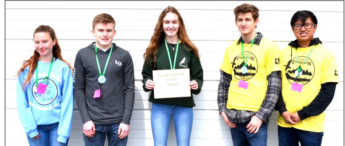
Newark Charter School Team B