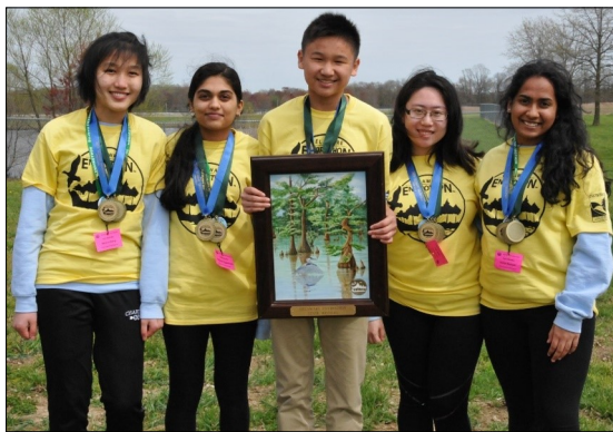
Charter School of Wilmington Team A 2019 State Champs

A program of the Delaware Association of Conservation Districts