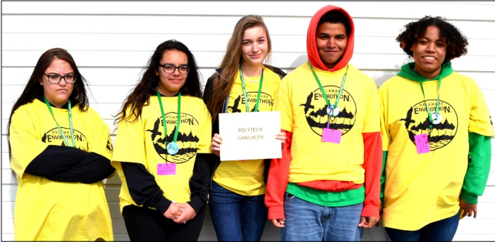
Polytech High School—Gangrene