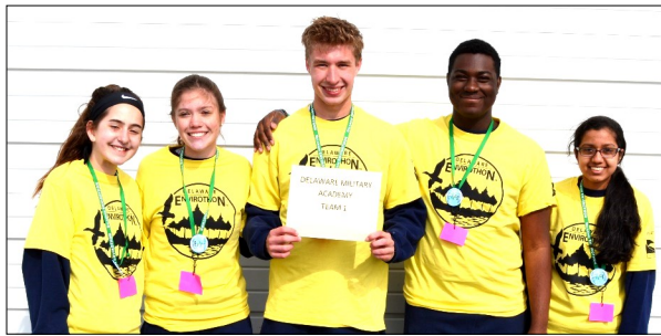
Delaware Military Academy Team 1