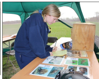
Scenes from the 2019 Envirothon