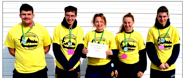
Delaware Military Academy Team 2