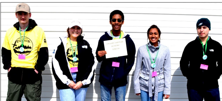
Calvary Christian Academy—Threens