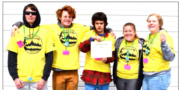
Sussex Tech FFA

Charter School of Wilmington teams shown on front page.