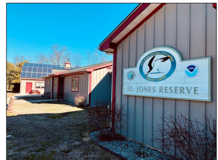
The 2021 event will be held on April 22nd at the St. Jones Re- serve in Dover.

The 2021 season began in August with the first meeting of the new school year for the Envirothon Planning Committee. Due to the pandemic, the Kent Conservation District will not hold the annual KCD Barn Dance fundraiser which normally brings in between $8,000 to $10,000 of the operating budget. We hope you will continue your financial support once we send out the 2021 fundraising appeal. Thank you for your continued generosity!