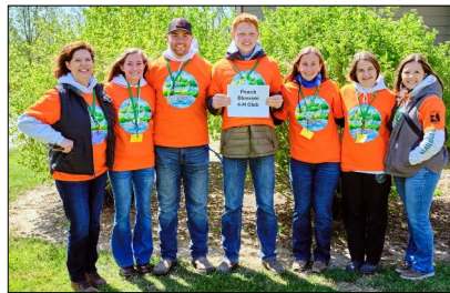
Peach Blossom 4-H Club

The St. Jones Estuarine Research Reserve in Dover was the setting for the 2022 competition which marked the school's 20th win in the event's 27-year history. Peach Blossom 4-H Club came in second place and the Odessa High School FFA team placed third. The event is a program of the Delaware Association of Conservation Districts and supported by many sponsors.