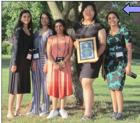
Charter School of Wilmington Team A