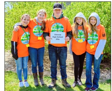
Odessa High School FFA

The Charter School of Wilmington Team A represented Delaware in the International NCF Envirothon held at Miami University in Oxford, Ohio the last week of July. The team placed 14th out of 40 teams from the United States, Canada, and China. Congratulations!